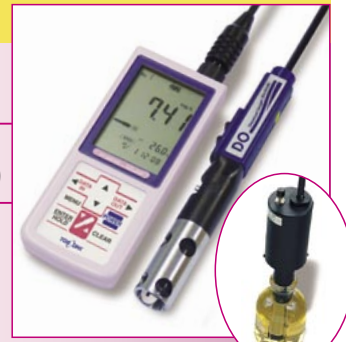
DO electrode for the incubator bottle

Note : For conducting BOD measurements, please place orders for the "main unit only" and the "DO electrode for the incubator bottle OE-470AA".