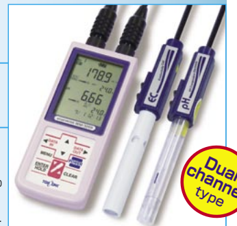
Dual channel type