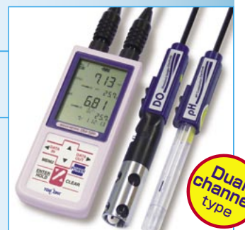
Dual channel type

Note : For conducting BOD measurements, please place orders for the "main unit only" and the "DO electrode for the incubator bottle OE-470AA".