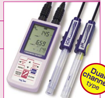
Dual channel type

The ORP electrode, ion electrode, and ion standard solutions are sold separately.