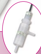
Electrical conductivity cell for pure water